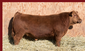
Crump Mega 8849