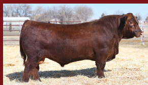
Crump New Decade 9341