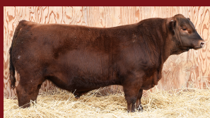
Crump Direct Affect 9861